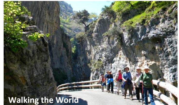
Walking the World